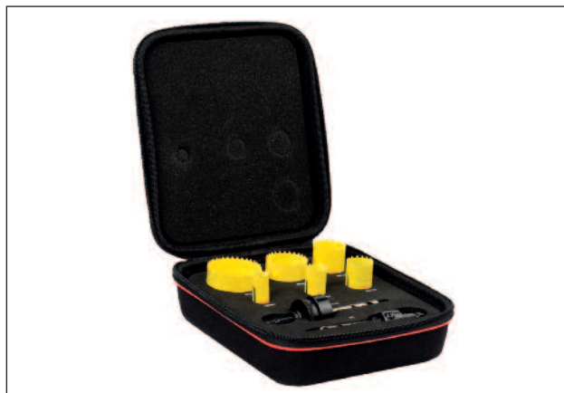
Fast Cut Hole Saw Kits also available. See pg 42