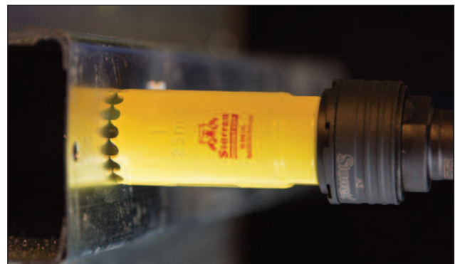
Fast Cut Hole Saw application.