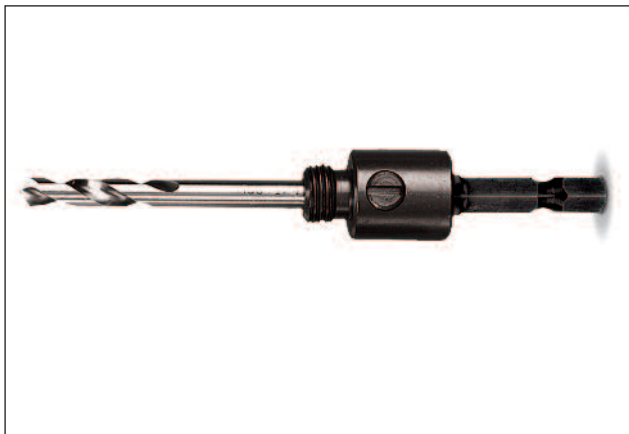
For the range of Arbors to suit. See pg 43