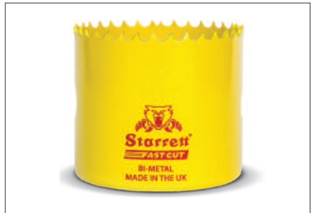
Fast Cut Hole Saw.