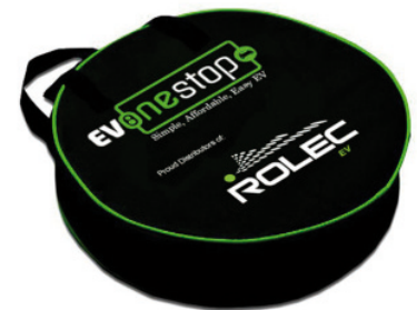
Charging Cable Carry Bag

EVACCD001 Photos / images are not contractual © copyright 2015